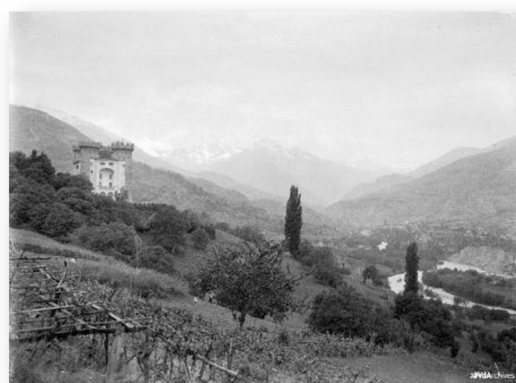
Photo Jules Brocherel, years 1920 Région autonome Vallée d'Aoste - Archives BREL - Fonds Brocherel-Broggi CC BY-NC-ND