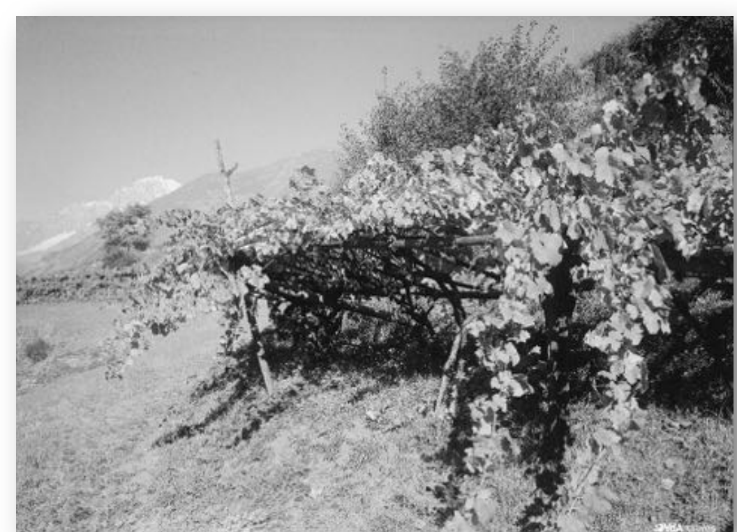
Photo Jules Brocherel, years 1920 Région autonome Vallée d'Aoste - Archives BREL - Fonds Brocherel-Broggi CC BY-NC-ND

Vineyard and wine-growing landscapes have been part of the history of the Region since pre-Roman times to the present days. There are numerous testimonies in travel journals by English tourists that indicate how the Pergola system was widespread in the nineteenth century throughout the Valley, even in areas where today the vine is cultivated exclusively with “spalliera” training system (guyot).