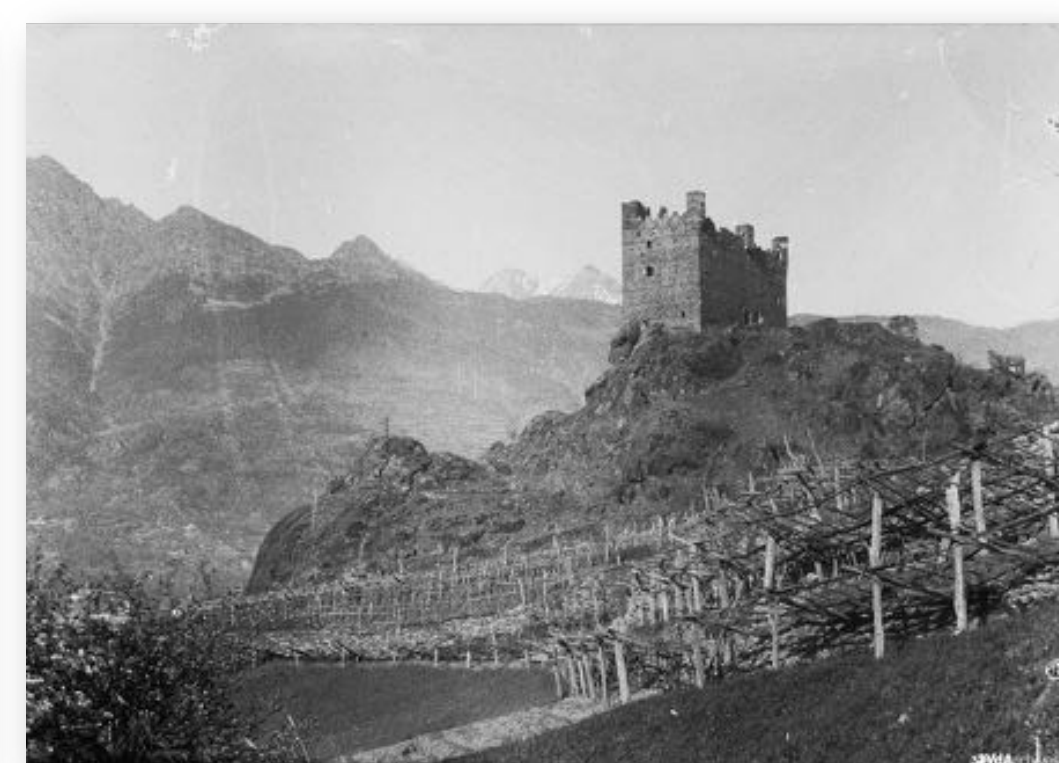
Author unidentified, years 1900 Région autonome Vallée d'Aoste - Archives BREL - Fonds Fisanotti CC BY-NC-ND